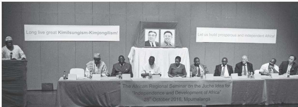
ARCSJI Board members and guests making speeches (in Republic of South Africa on Oct. 28, 2016)

Present at the seminar held at the city hall of Emalahleni local municipality in South Africa were Juche idea researchers internal and external.