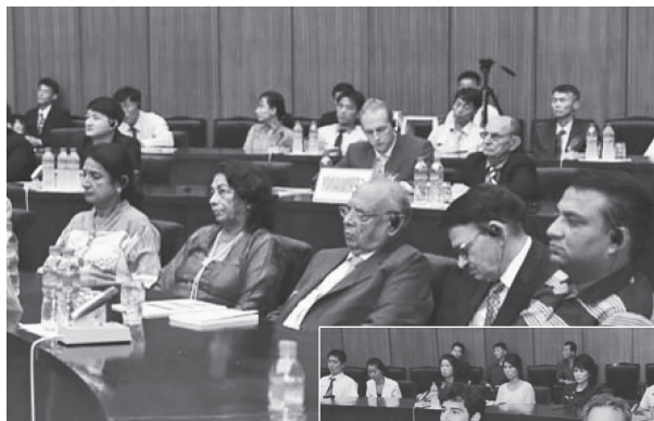
Delegates attentively listening to speeches

In the seminar, speeches were delivered by the delegates from India, Sri Lanka, Mongolia, Nepal, Italy, Spain, England and Russia.