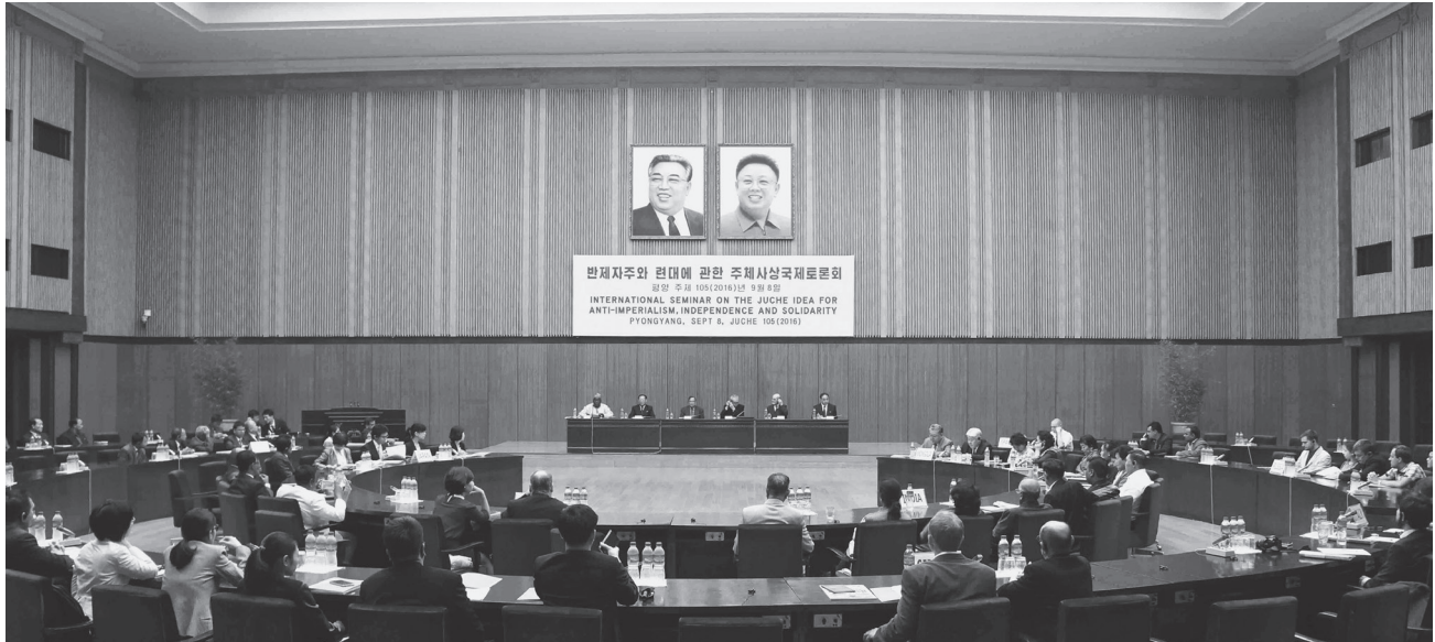
Speeches were made in relation to Kimilsung-Kimjongilism (in Pyongyang, on Sep. 8, 2016).

The seminar was held in Pyongyang on September 8, 2016 under the auspices of the IIJI.