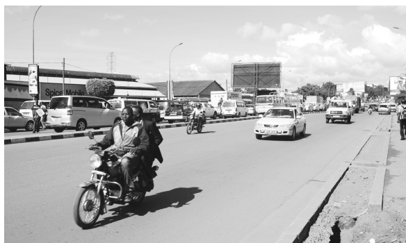
Kampala, the capital of Uganda, in which the seminar was held

The President of the ARCSJI has visited the Democratic People's Republic of Korea (DPRK), the land of Juche, six times. During his