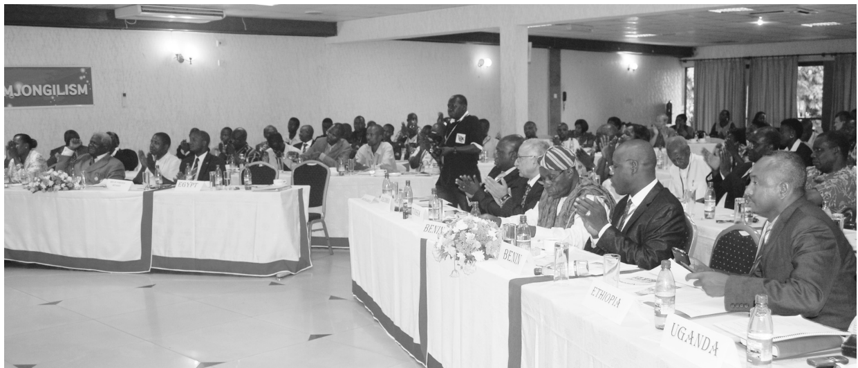
Attentive participants at the African regional seminar (in Kampala on May 11, 2013)

Long live the independent and transformed Africa!