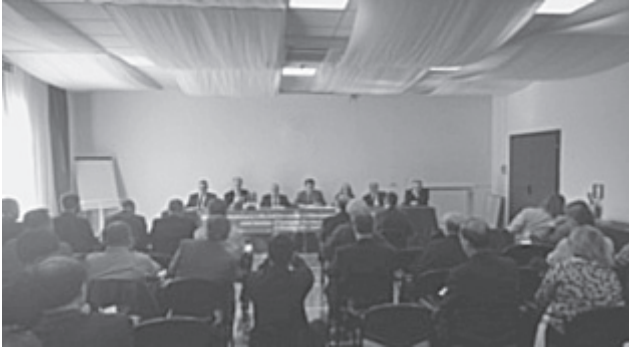
(A view of the European Seminar in Rome on Nov. 22, 2014)

On the occasion of the commemoration of the third anniversary of the demise of General Secretary Kim Jong Il, a European Seminar was held in Rome on November 22, 2014 to discuss the Juche idea while looking back on his life and achievements.