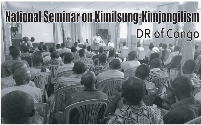
A national seminar organized by the National Association for the Study of the Juche idea, the Democratic Republic of the Congo was held in February 2014. What was delivered there is the results of their study on the works of First Secretary Kim Jong Un.

It has been spreading as a must-read book in studying Kimilsung-Kimjongilism in depth.