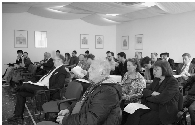
Participants listening earnestly to speeches by representatives of Juche idea study groups from European countries

Representatives from ten European countries, who delivered their speeches, mentioned the realities of their countries and the issues raised in establishing their independence.