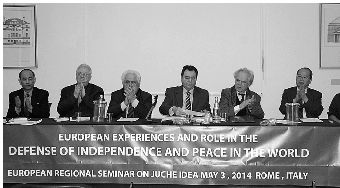
The platform of the European seminar on the Juche idea (May 3, 2014, Rome)

The European Regional Society for the Study of the Juche Idea (ERSSJI) held a regional seminar on the Juche idea in Rome on May 3, 2014 and members of Juche idea study groups from European countries joined.