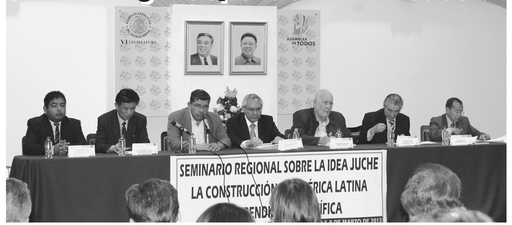
In the seminar emphasis was put on the importance of studying the Juche idea in the cause of independence and anti-imperialism.

A Latin American Regional Seminar on the Juche Idea was held in the Assembly Hall in Mexico F.D. on March 8, 2013.