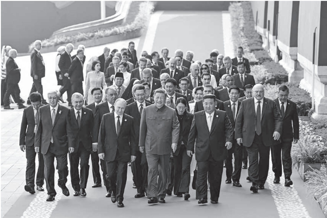
Kim Jong Un, general secretary of the WPK, who attended commemorative events for the 80th anniversary of the victory of the Chinese people's resistance to anti-Japanese militarism and of that in the world anti-fascist war (Beijing on September 3, 2025)

is hostile and the countries that adhere to independence is growing to please the US. All countries have the right to exercise independent politics.