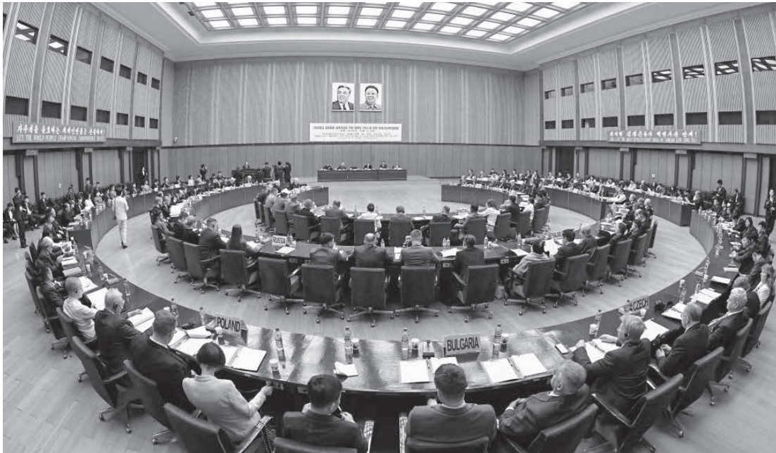
A view of the International Seminar of the Juche idea on "Immortal Banner for Building Just and Peaceful World" (Pyongyang on October 8-9, 2025)

which love independence and sovereignty to follow the path of self-reliance in every field. President Kim Il Sung during the Japanese rule had experienced and seen the suffering of his people. To liberate Korea, he highlighted to his people the importance of strong armed-forces for independence, freedom and sovereignty.