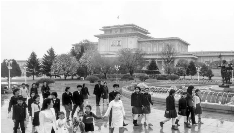
At the Kumsusan Palace of the Sun (on April 15, 2024)

One of Kim Jong Il's achievements was to have formulated President Kim Il Sung's revolutionary thoughts as Kimilsungism, an integral system of ideas, theories and methods of Juche, and to have specified the guiding idea of the new era in which the people of each country emerged as masters.