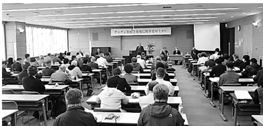
A view of a National Seminar on the Juche Idea and Nuclear Plants Issue (Fukushima, Japan, on April 20, 2024)

Let us accelerate the study and dissemination of the Juche idea by cooperating with Juche idea researchers in individual countries and their respective regions, while making close contact with the International Institute of the Juche Idea.